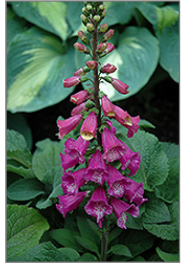
Candy Mountain Foxglove flowers

Unique, upward facing flowers of violet-rose with white interiors and dark purple spots; tall spikes rise above attractive green oblong shaped leaves; a biennial that's happiest in part shade with adequate moisture