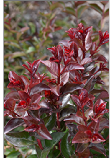
Cherry Mocha Crapemyrtle foliage

Cherry Mocha Crapemyrtle makes a fine choice for the outdoor landscape, but it is also well-suited for use in outdoor pots and containers. With its upright habit of growth, it is best suited for use as a 'thriller' in the 'spiller-thriller-filler' container combination; plant it near the center of the pot, surrounded by smaller plants and those that spill over the edges. It is even sizeable enough that it can be grown alone in a suitable container. Note that when grown in a container, it may not perform exactly as indicated on the tag - this is to be expected. Also note that when growing plants in outdoor containers and baskets, they may require more frequent waterings than they would in the yard or garden.