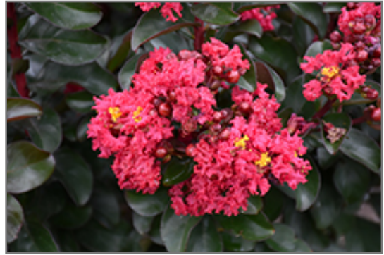
Cherry Mocha Crapemyrtle flowers

Cherry Mocha Crapemyrtle is recommended for the following landscape applications;