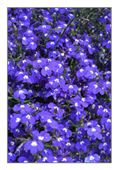
Techno Upright Cobalt Blue Lobelia flowers

This plant will require occasional maintenance and upkeep, and should not require much pruning, except when necessary, such as to remove dieback. It is a good choice for attracting butterflies to your yard. It has no significant negative characteristics.