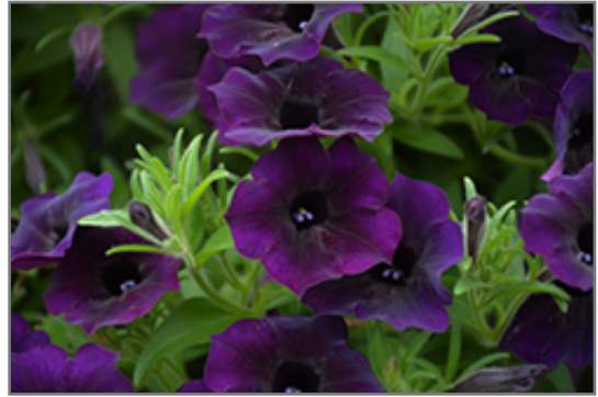
Supertunia Mini Vista Midnight Petunia flowers

This plant will require occasional maintenance and upkeep. Trim off the flower heads after they fade and die to encourage more blooms late into the season. It is a good choice for attracting butterflies and hummingbirds to your yard, but is not particularly attractive to deer who tend to leave it alone in favor of tastier treats. It has no significant negative characteristics.