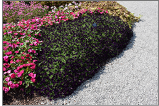
Supertunia Mini Vista Midnight Petunia in bloom

Supertunia Mini Vista Midnight Petunia will grow to be about 8 inches tall at maturity, with a spread of 24 inches. When grown in masses or used as a bedding plant, individual plants should be spaced approximately 20 inches apart. Its foliage tends to remain low and dense right to the ground. This fast-growing annual will normally live for one full growing season, needing replacement the following year.