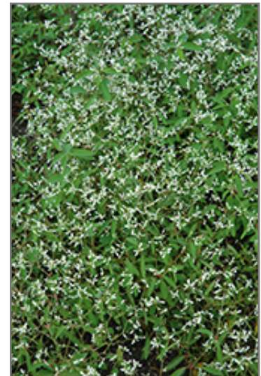
Breathless White Euphorbia flowers