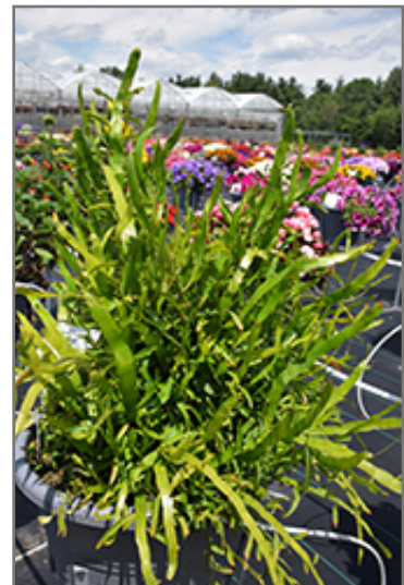
Ribbons and Curls Ribbon Bush