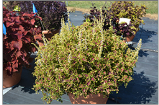
Under The Sea Electric Coral Coleus

Under The Sea Electric Coral Coleus will grow to be about 20 inches tall at maturity, with a spread of 24 inches. When grown in masses or used as a bedding plant, individual plants should be spaced approximately 20 inches apart. Although it's not a true annual, this fast-growing plant can be expected to behave as an annual in our climate if left outdoors over the winter, usually needing replacement the following year. As such, gardeners should take into consideration that it will perform differently than it would in its native habitat.