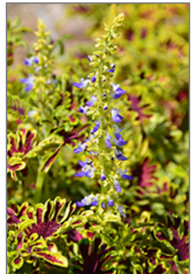
Under The Sea Electric Coral Coleus flowers