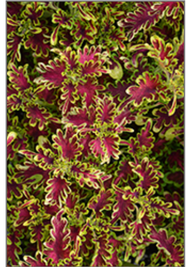
Under The Sea Electric Coral Coleus foliage

Under The Sea Electric Coral Coleus is recommended for the following landscape applications;