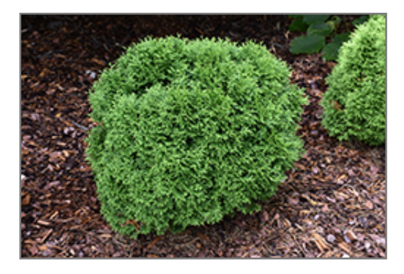
Tater Tot Arborvitae

8140 OH-105, Bowling Green, OH 43402 www.wolfsbloomsandberries.com (419) 352-3577