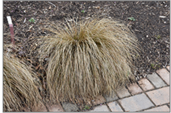
Prairie Fire Sedge

Prairie Fire Sedge is recommended for the following landscape applications;