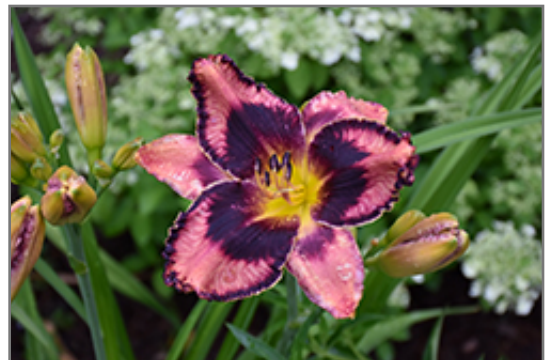
Rainbow Rhythm Storm Shelter Daylily flowers