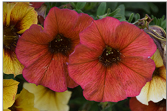
SuperCal Premium Cinnamon Petchoa flowers