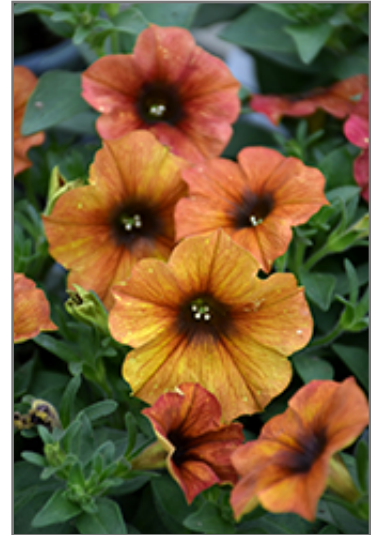
SuperCal Premium Cinnamon Petchoa flowers

This plant will require occasional maintenance and upkeep. Trim off the flower heads after they fade and die to encourage more blooms late into the season. It is a good choice for attracting hummingbirds to your yard, but is not particularly attractive to deer who tend to leave it alone in favor of tastier treats. It has no significant negative characteristics.