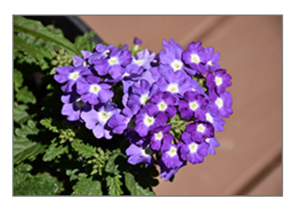
Empress Flair Amethyst Charme Verbena flowers