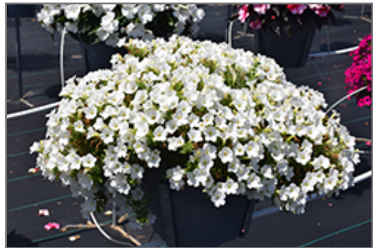
Itsy White Petunia in bloom