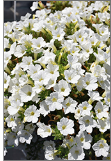
Itsy White Petunia flowers

This plant will require occasional maintenance and upkeep. Trim off the flower heads after they fade and die to encourage more blooms late into the season. It is a good choice for attracting bees, butterflies and hummingbirds to your yard, but is not particularly attractive to deer who tend to leave it alone in favor of tastier treats. It has no significant negative characteristics.