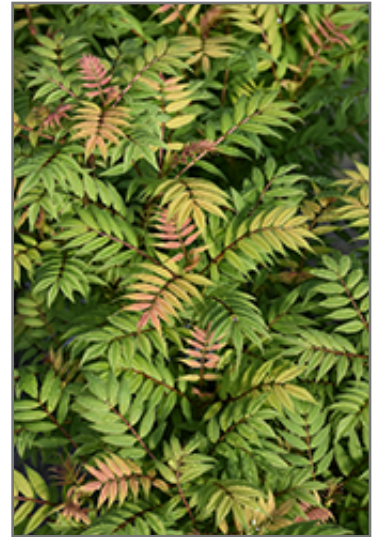
Mr. Mustard False Spirea foliage