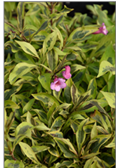
Bubbly Wine Weigela flowers