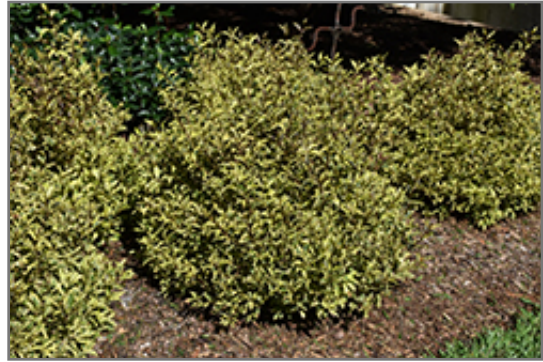
Bubbly Wine Weigela

Bubbly Wine Weigela will grow to be about 24 inches tall at maturity, with a spread of 3 feet. It tends to fill out right to the ground and therefore doesn't necessarily require facer plants in front. It grows at a medium rate, and under ideal conditions can be expected to live for approximately 30 years.