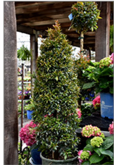
Dwarf Brush Cherry

Dwarf Brush Cherry is recommended for the following landscape applications;