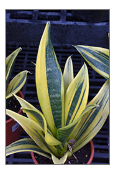
Golden Flame Snake Plant flowers

When grown indoors, Golden Flame Snake Plant can be expected to grow to be about 3 feet tall at maturity, with a spread of 24 inches. It grows at a slow rate, and under ideal conditions can be expected to live for approximately 10 years. This houseplant performs well in both bright or indirect sunlight and strong artificial light, and can therefore be situated in almost any well-lit room or location. It is very adaptable to both dry and moist soil, but will not tolerate any standing water. The surface of the soil shouldn't be allowed to dry out completely, and so you should expect to water this plant once and possibly even twice each week. Be aware that your particular watering schedule may vary depending on its location in the room, the pot size, plant size and other conditions; if in doubt, ask one of our experts in the store for advice. It will benefit from a regular feeding with a general-purpose fertilizer with every second or third watering. It is not particular as to soil pH, but grows best in sandy soil. Contact the store for specific recommendations on pre-mixed potting soil for this plant.