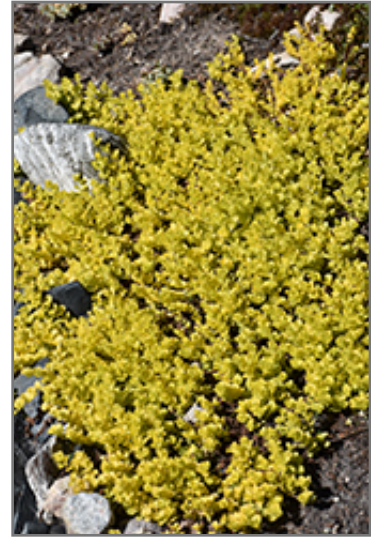
Goldilocks Creeping Jenny

Goldilocks Creeping Jenny will grow to be only 6 inches tall at maturity, with a spread of 3 feet. When grown in masses or used as a bedding plant, individual plants should be spaced approximately 24 inches apart. Its foliage tends to remain low and dense right to the ground. It grows at a fast rate, and under ideal conditions can be expected to live for approximately 10 years. As an herbaceous perennial, this plant will usually die back to the crown each winter, and will regrow from the base each spring. Be careful not to disturb the crown in late winter when it may not be readily seen!