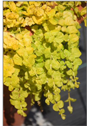
Goldilocks Creeping Jenny foliage