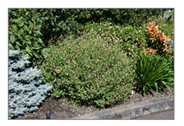
Hot Lips Sage in bloom

Hot Lips Sage is an herbaceous evergreen perennial with an upright spreading habit of growth. Its relatively fine texture sets it apart from other garden plants with less refined foliage.