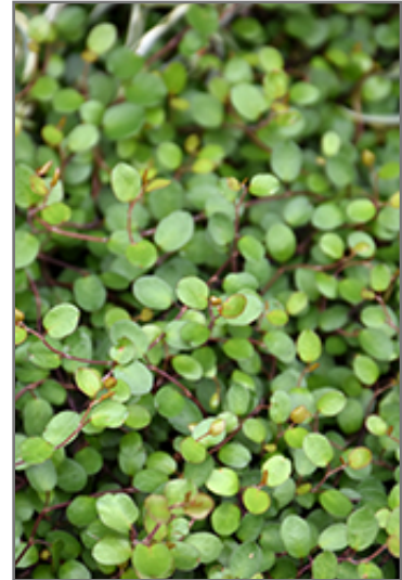
Creeping Wire Vine foliage