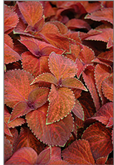
Wizard Sunset Coleus foliage

Wizard Sunset Coleus is recommended for the following landscape applications;