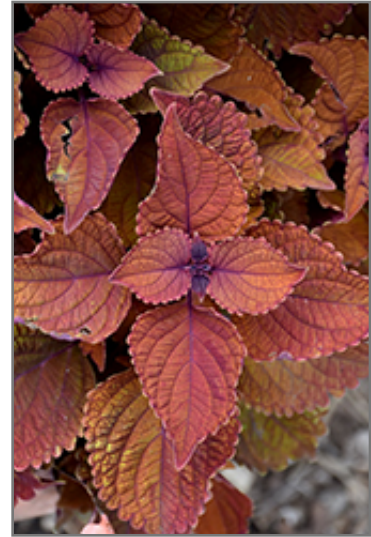
Wall Street Coleus foliage