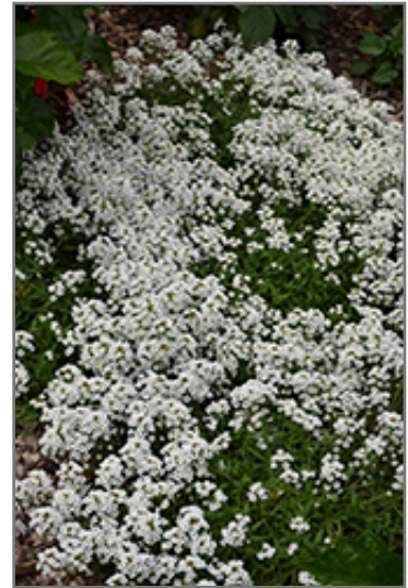
Stream White Sweet Alyssum in bloom