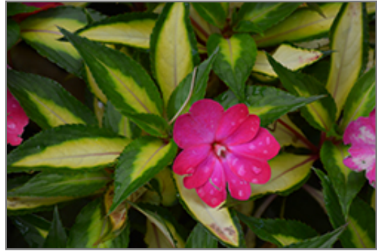
SunPatiens Compact Tropical Rose New Guinea Impatiens flowers