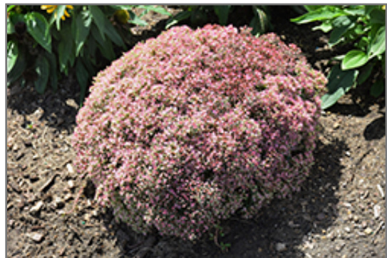
Rock 'N Round Pride and Joy Stonecrop in bloom