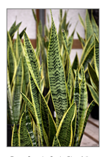
Futura Superba Snake Plant foliage

When grown indoors, Futura Superba Snake Plant can be expected to grow to be about 18 inches tall at maturity, with a spread of 12 inches. It grows at a slow rate, and under ideal conditions can be expected to live for approximately 10 years. This houseplant performs well in both bright or indirect sunlight and strong artificial light, and can therefore be situated in almost any well-lit room or location. It is very adaptable to both dry and moist soil, and should do just fine under average home conditions. The surface of the soil shouldn't be allowed to dry out completely, and so you should expect to water this plant once and possibly even twice each week. Be aware that your particular watering schedule may vary depending on its location in the room, the pot size, plant size and other conditions; if in doubt, ask one of our experts in the store for advice. It is not particular as to soil pH, but grows best in sandy soil. Contact the store for specific recommendations on pre-mixed potting soil for this plant. Be warned that parts of this plant are known to be toxic to humans and animals, so special care should be exercised if growing it around children and pets.