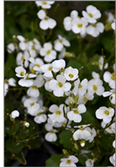
Catwalk White Wall Cress flowers

Catwalk White Wall Cress is recommended for the following landscape applications;