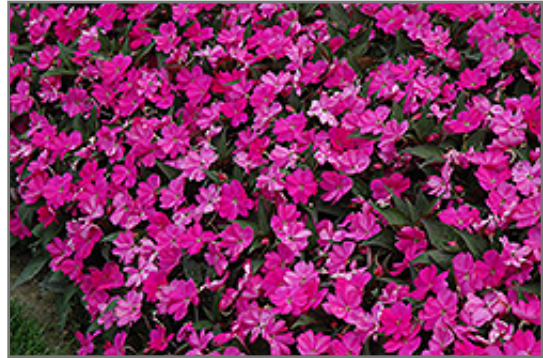
SunPatiens Compact Lilac New Guinea Impatiens in bloom

SunPatiens Compact Lilac New Guinea Impatiens will grow to be about 24 inches tall at maturity, with a spread of 24 inches. When grown in masses or used as a bedding plant, individual plants should be spaced approximately 20 inches apart. Its foliage tends to remain dense right to the ground, not requiring facer plants in front. This fast-growing annual will normally live for one full growing season, needing replacement the following year.