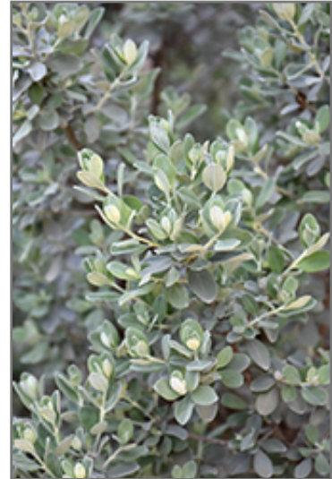
Texas Sage foliage

Texas Sage makes a fine choice for the outdoor landscape, but it is also well-suited for use in outdoor pots and containers. With its upright habit of growth, it is best suited for use as a 'thriller' in the 'spiller-thriller-filler' container combination; plant it near the center of the pot, surrounded by smaller plants and those that spill over the edges. It is even sizeable enough that it can be grown alone in a suitable container. Note that when grown in a container, it may not perform exactly as indicated on the tag - this is to be expected. Also note that when growing plants in outdoor containers and baskets, they may require more frequent waterings than they would in the yard or garden. Be aware that in our climate, this plant may be too tender to survive the winter if left outdoors in a container. Contact our experts for more information on how to protect it over the winter months.