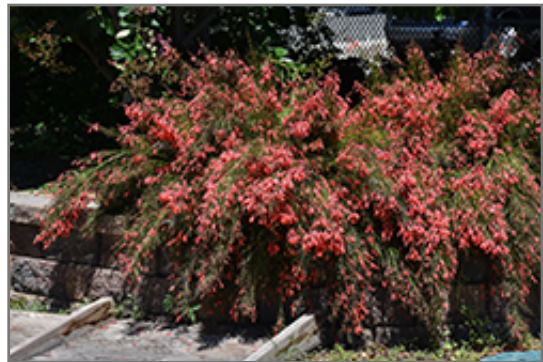
Firecracker Plant in bloom