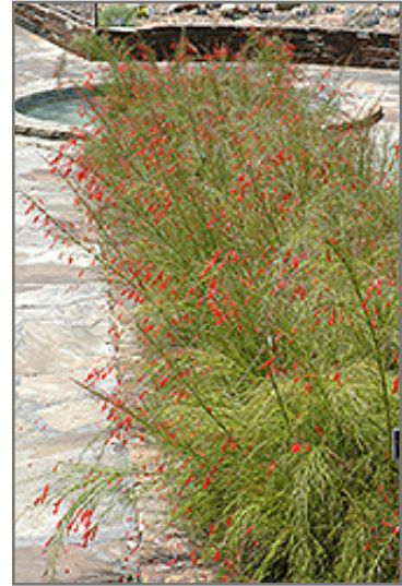
Firecracker Plant in bloom

Firecracker Plant is a fine choice for the garden, but it is also a good selection for planting in outdoor containers and hanging baskets. Because of its height, it is often used as a 'thriller' in the 'spiller-thriller-filler' container combination; plant it near the center of the pot, surrounded by smaller plants and those that spill over the edges. It is even sizeable enough that it can be grown alone in a suitable container. Note that when growing plants in outdoor containers and baskets, they may require more frequent waterings than they would in the yard or garden.