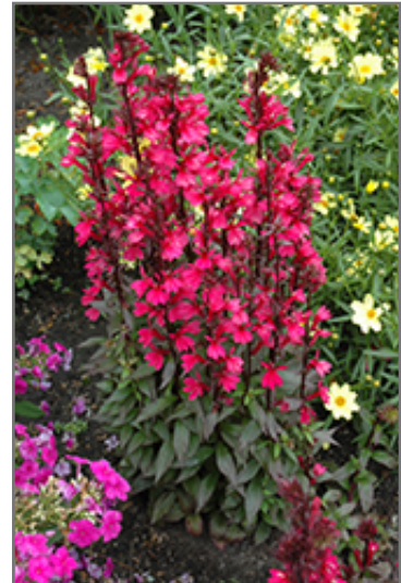
Starship Deep Rose Lobelia in bloom