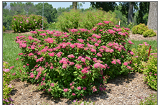
Double Play Red Spirea in bloom