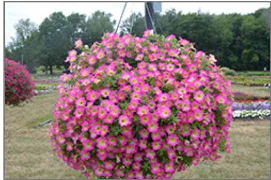
Supertunia Daybreak Charm Petunia in bloom