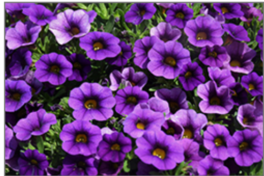
Calipetite Blue Calibrachoa flowers