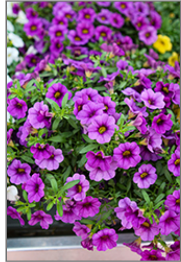
Calipetite Blue Calibrachoa flowers

This plant will require occasional maintenance and upkeep. Trim off the flower heads after they fade and die to encourage more blooms late into the season. It is a good choice for attracting bees and hummingbirds to your yard, but is not particularly attractive to deer who tend to leave it alone in favor of tastier treats. It has no significant negative characteristics.