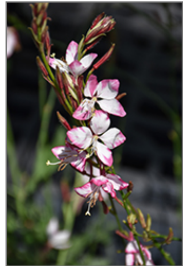
Rosy Jane Gaura flowers

Rosy Jane Gaura is recommended for the following landscape applications;