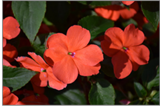
Beacon Salmon Impatiens flowers

Beacon Salmon Impatiens will grow to be about 15 inches tall at maturity, with a spread of 12 inches. When grown in masses or used as a bedding plant, individual plants should be spaced approximately 8 inches apart. Its foliage tends to remain dense right to the ground, not requiring facer plants in front. This fast-growing annual will normally live for one full growing season, needing replacement the following year.