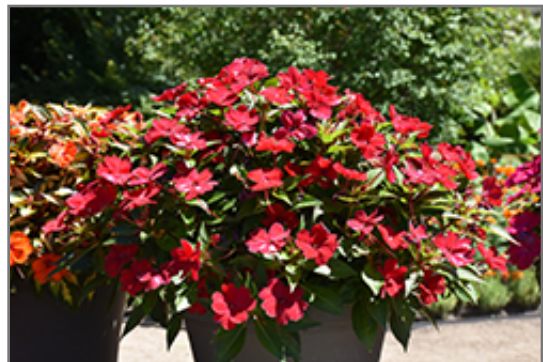
SunPatiens Vigorous Red Impatiens in bloom