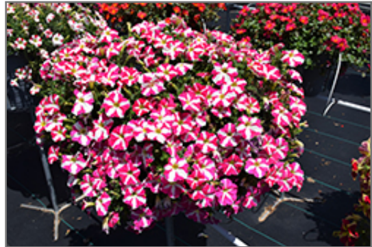
Amore Pink Heart Petunia in bloom