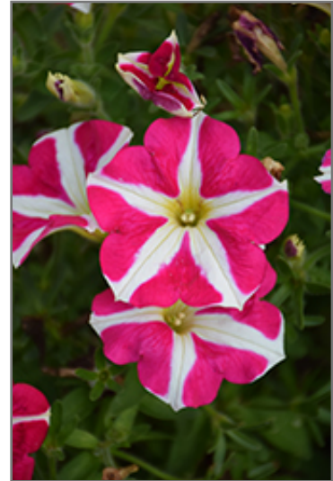
Amore Pink Heart Petunia flowers

Amore Pink Heart Petunia is a fine choice for the garden, but it is also a good selection for planting in outdoor containers and hanging baskets. It is often used as a 'filler' in the 'spiller-thriller-filler' container combination, providing a mass of flowers against which the thriller plants stand out. Note that when growing plants in outdoor containers and baskets, they may require more frequent waterings than they would in the yard or garden.