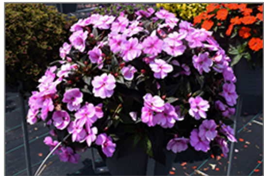
SunPatiens Vigorous Lavender Splash New Guinea Impatiens in bloom