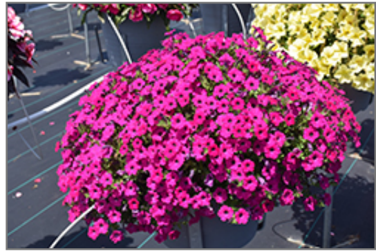
Itsy Magenta Petunia in bloom