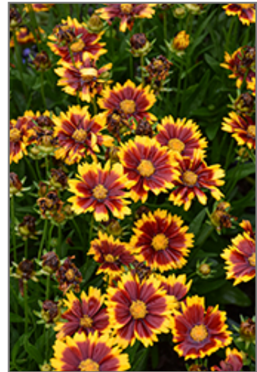
UpTick Red Tickseed flowers

UpTick Red Tickseed is recommended for the following landscape applications;