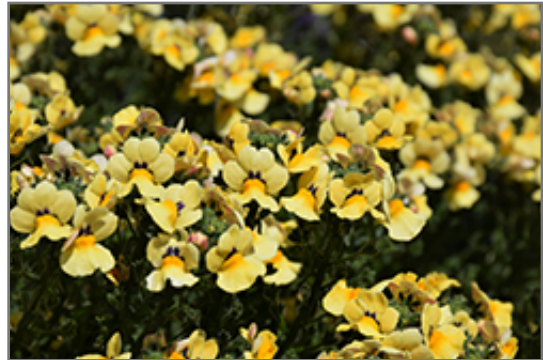
Nesia Inca Nemesia flowers