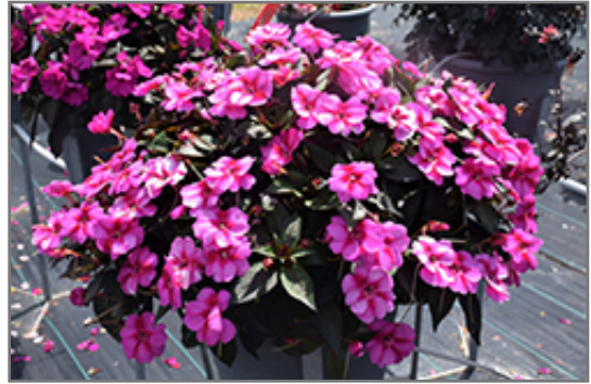
SunPatiens Compact Purple Candy Impatiens in bloom

SunPatiens Compact Purple Candy Impatiens will grow to be about 26 inches tall at maturity, with a spread of 20 inches. When grown in masses or used as a bedding plant, individual plants should be spaced approximately 18 inches apart. Its foliage tends to remain dense right to the ground, not requiring facer plants in front. This fast-growing annual will normally live for one full growing season, needing replacement the following year.