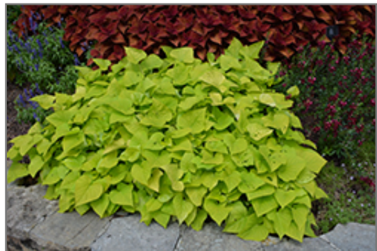
Sweet Georgia Heart Light Green Sweet Potato Vine