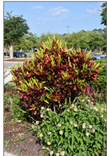
Mammy Croton