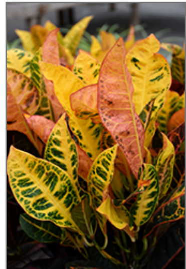
Petra Variegated Croton foliage