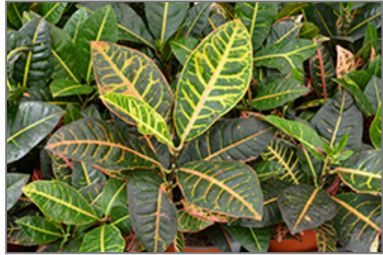
Petra Variegated Croton foliage

This plant does best in partial shade to shade. It does best in average to evenly moist conditions, but will not tolerate standing water. This plant does not require much in the way of fertilizing once established. It is not particular as to soil pH, but grows best in rich soils. It is somewhat tolerant of urban pollution. This is a selected variety of a species not originally from North America, and parts of it are known to be toxic to humans and animals, so care should be exercised in planting it around children and pets. It can be propagated by cuttings; however, as a cultivated variety, be aware that it may be subject to certain restrictions or prohibitions on propagation.