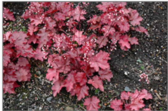
Fire Chief Coral Bells